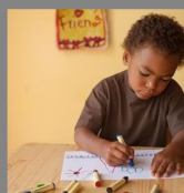
Color a picture