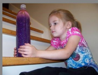
Look at a glitter calming bottle