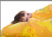
Rest on my pillow