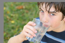
Get a drink of water